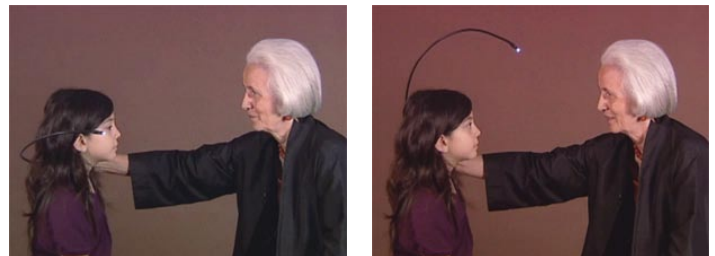
Figure 1. The tester brings the LEA Flicker Wand forward from behind the child, who is fixating on the face of the tester. When the child notices the stimulus, the child's eyes turn to the stimulus with quick saccade.

The LEA Flicker Wand can be used as the stimulus on an arc perimeter, which results in more exact measurements.